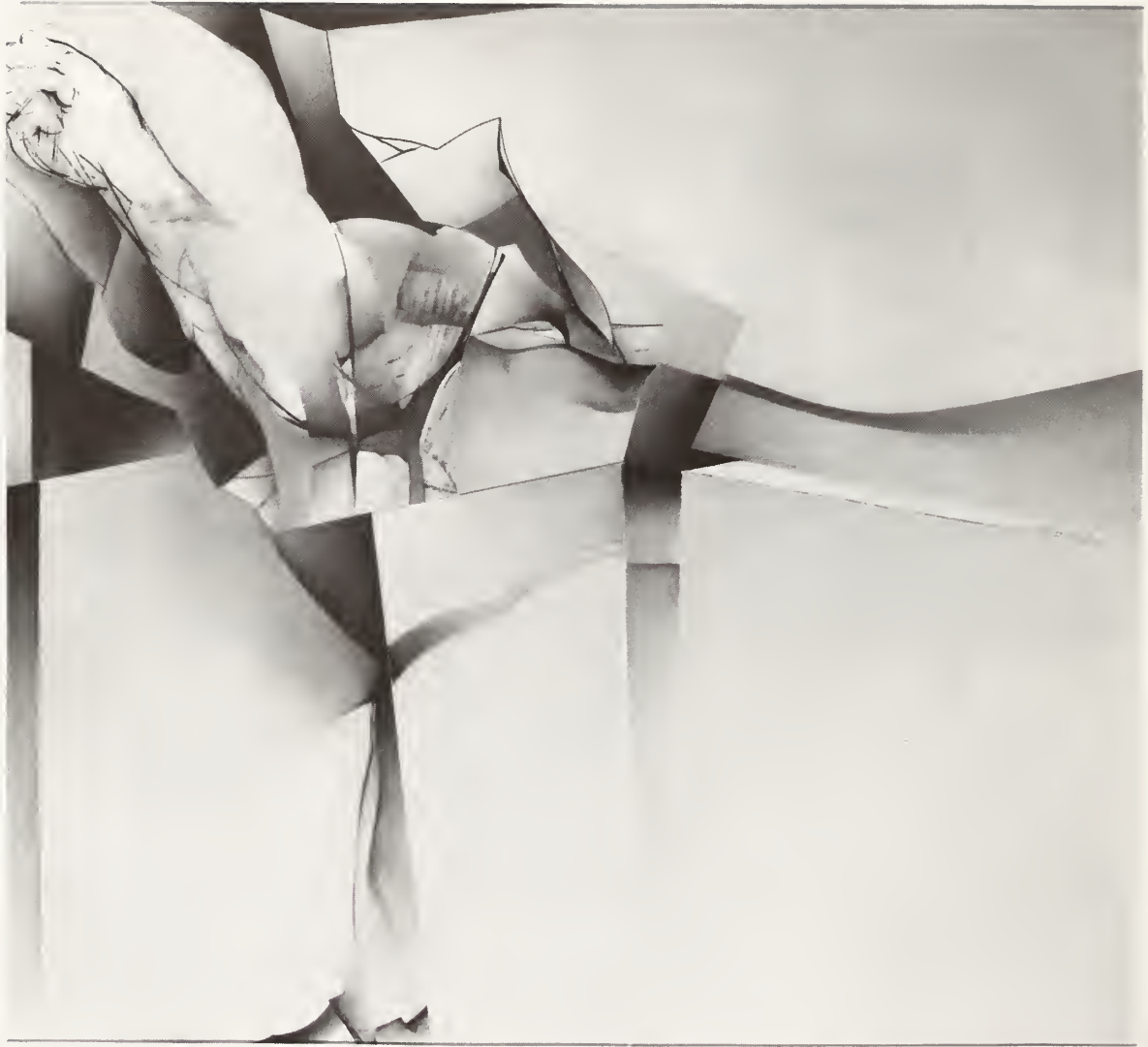
Thomas Hilty, American Dream #5 Best of Show